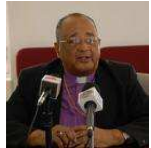
Archbishop Drexel Gomez

The debate opened to the sound of thunder and torrential rain beating down upon the roof – reflecting, for a packed Synod, the gravity of the situation facing the Anglican Communion. Archbishop Drexel Gomez spoke of our 'bonds of affection' being 'strained or broken' and of the proposed 'Covenant' as a way towards a process which would help us deal better with painful conflict. Three amendments, the first seeking to include sexual ethics in the motion and the others, seeking to tone down our enthusiasm for the covenant and make it more accountable to Synod were all defeated. People spoke with passion, but with seriousness and respect. Those in favour saw this as a last chance to avoid division. They pointed to the need to set limits to our unity and of the covenant content as 'uncontentious'. Those against feared it would be used as a means of 'excluding' some provinces from the communion and that it would constitute 'the biggest change to the Anglican Church since the Reformation.' They feared that written agreements (which have already been broken) would not solve the crisis, but only listening to one another in love. The Bishop of Durham's passionate appeal for the Covenant won the day and Synod voted, by a substantial majority, to support the process of working out a covenant for the Communion which all can support. It is unlikely to prove an easy task!