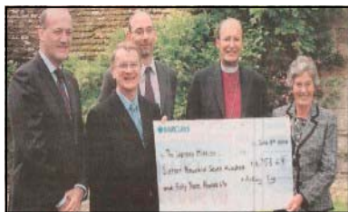
Accepting the cheque from the Bishop of Ely and his wife are the Director, Chairman and Area Representative of the Leprosy Mission

The money was raised by parishes across the Diocese as part of their charitable giving during the Lent season—together with help from individuals and other organisations.