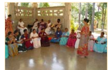
Women staff in the Chapel on the World Day of Prayer 2008

No one with leprosy is ever turned away. There is also a vibrant hospital church and committed chaplaincy team who provide spiritual care.