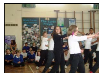
Bangra Dancers displaying their talents

The opening ceremony included much joyous singing, and also a display of bangra dancing from the Punjab by Year 6 pupils (which had been learnt in a very short time that morning).