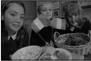
Pupils enjoy the French cuisine

Nearly 100 pupils at Cheveley Church of England Primary School joined in with teachers and staff.