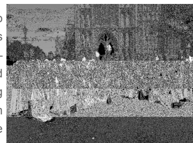
Ordination at Cathedral